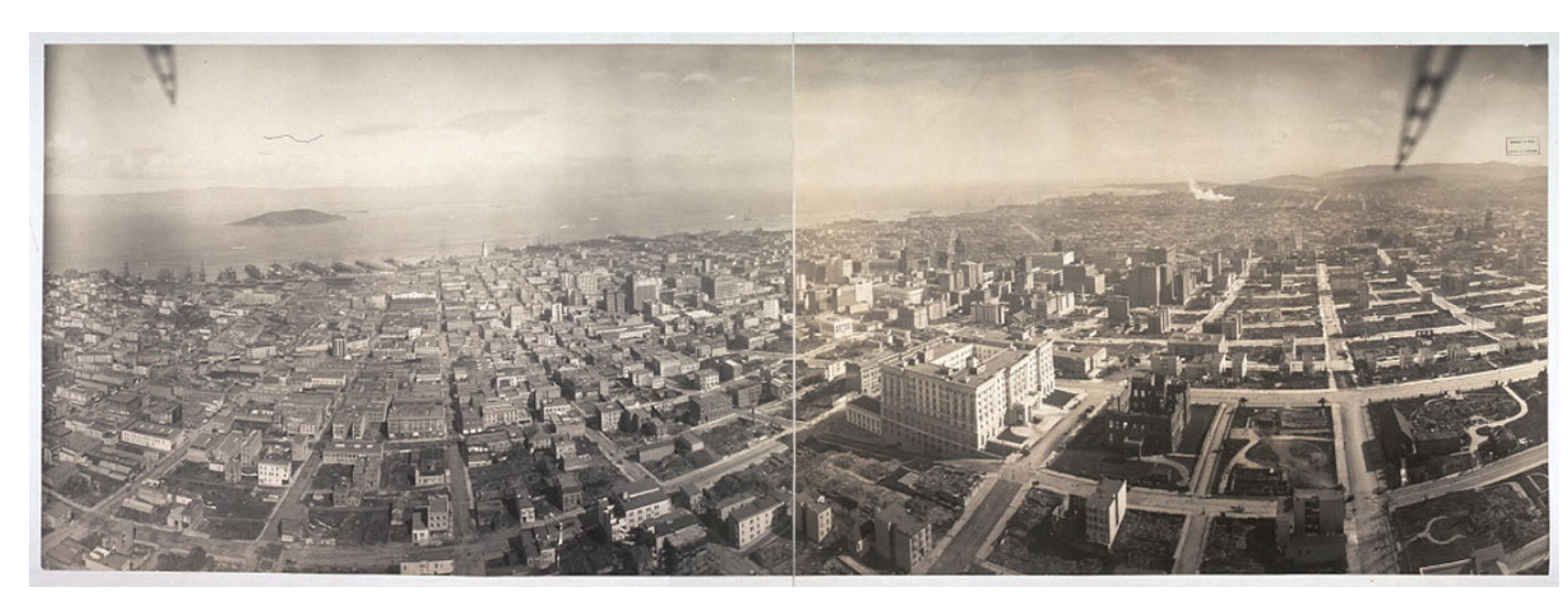
Three Years After, San Francisco, April 1909. San Francisco, Cal.: R.J. Waters Aerial Photograph Co., April 1909. Panoramic Photographs. Prints & Photographs Division

Over 3,000 people are estimated to have died as a result of the disaster. For those who survived, the first few weeks were hard; as aid poured in from around the country, thousands slept in tents in city parks, and citizens were asked to do their cooking in the street. A severe shortage of public transportation made a taxicab out of anything on wheels. Numerous businesses relocated temporarily to Oakland, and many refugees found lodgings outside the city. Most of the cities of central California were badly damaged. However, reconstruction proceeded at a furious pace, and by 1908, San Francisco was well on the way to recovery.