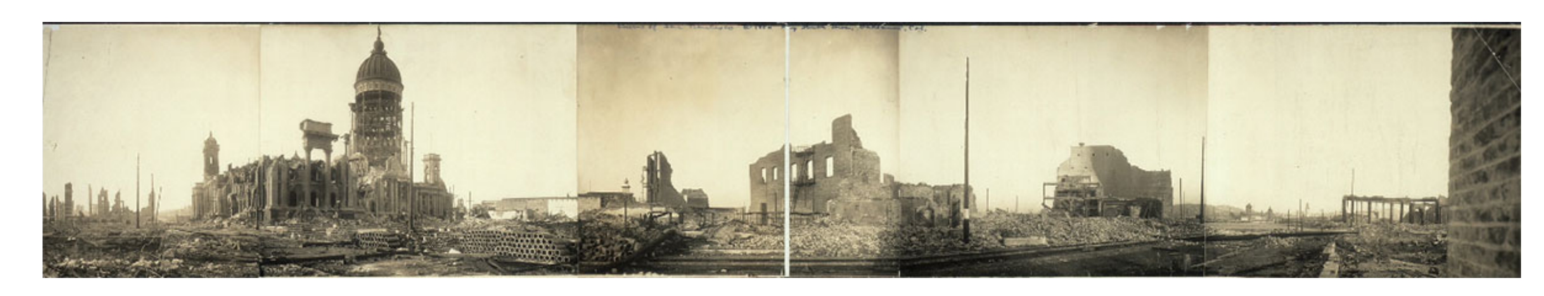
Ruins of San Francisco from the Site of the Mechanics' Pavilion. Oakland, Calif: Smith Bros., c1906. Panoramic Photographs. Prints & Photographs Division

At 5:12 a.m. on April 18, 1906, a magnitude 8.3 (Richter Scale) earthquake struck San Francisco. With thousands of un-reinforced brick buildings and closely-spaced wooden Victorian dwellings, the city was poorly prepared for the quake. Collapsed buildings, broken chimneys, and a water shortage due to broken mains, led to several large fires that soon coalesced into a citywide holocaust. The fire raged for three days, sweeping over nearly a quarter of the city, including the entire downtown area.